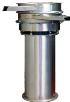
- Screen with raised base