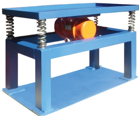
- Compacting table

Thanks to our great production flexibility, we can manufacture special versions of our products to meet the needs of our customers. Some examples of the products in question can be seen in the photo gallery: