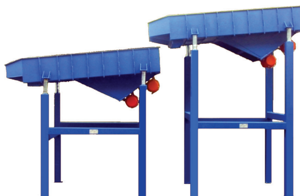
- Rectangular screens in series