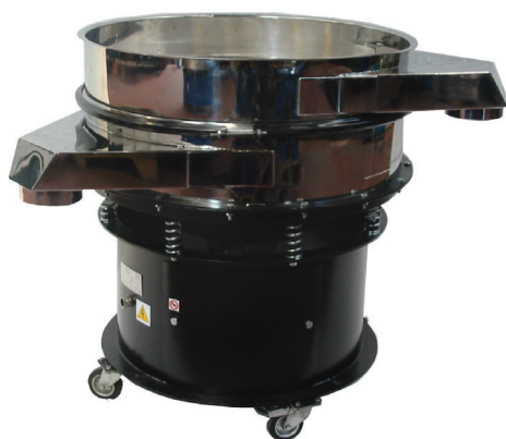
- Mirror-polished finishing